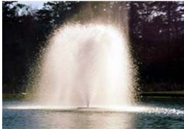
BIRCH (No Nozzle)