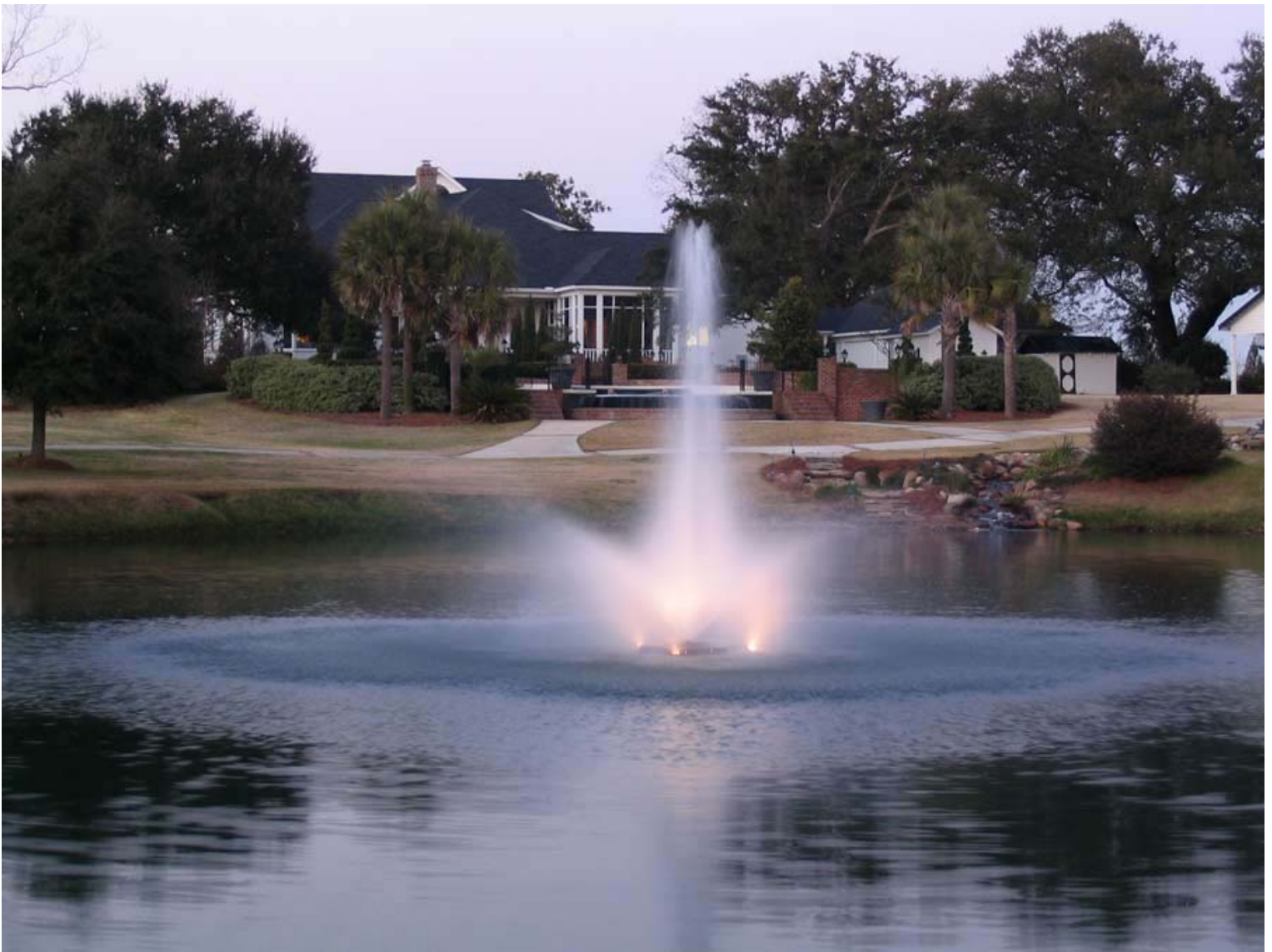
LINDEN DISPLAY WITH LIGHTS AT DUSK