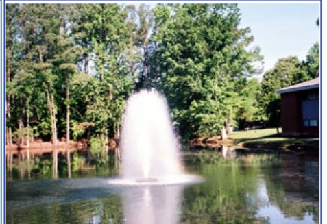
BIRCH (No Nozzle)